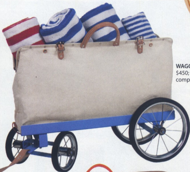
WAGON No. 1, $450; welcome companions.com