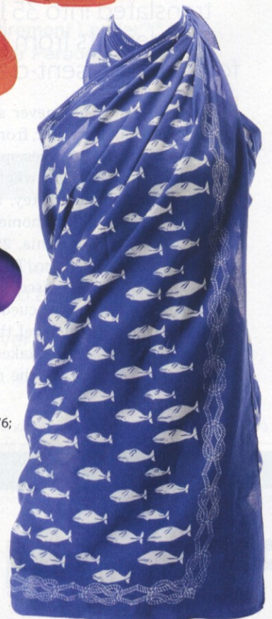
By the Sea Indigo Whale Logo Sarong, $76; bytheseacompany.com