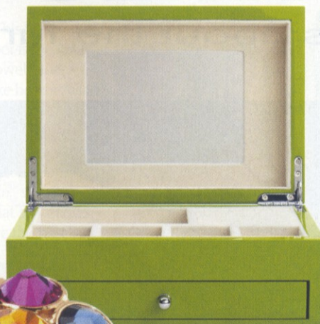
Reed & Barton Granny Smith Jewelry Box (9½" by 6¾" by 4"), $150; reedandbarton.com

Our editors' must-have picks for Mother's Day