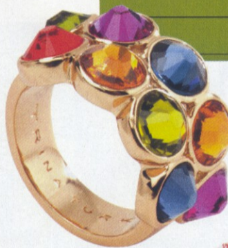
Trina Turk City Lights Ring, $75; trinaturk.com