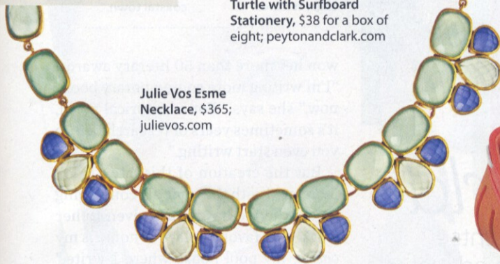
Julie Vos Esme Necklace, $365; julievos.com