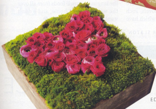
Olive & Cocoa Bella Rose Lecoer, $98; oliveandcocoa.com