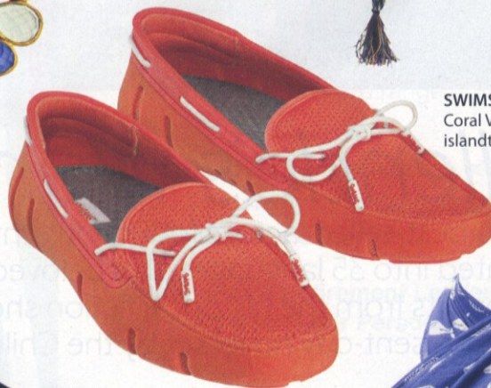
SWIMS Lace Loafers in Coral Velvet/White, $179; islandtrends.com