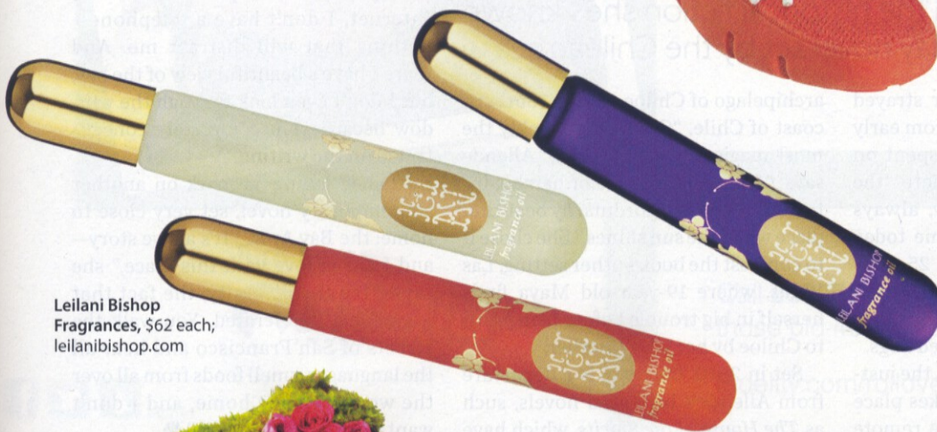
Leilani Bishop Fragrances, $62 each; leilanibishop.com