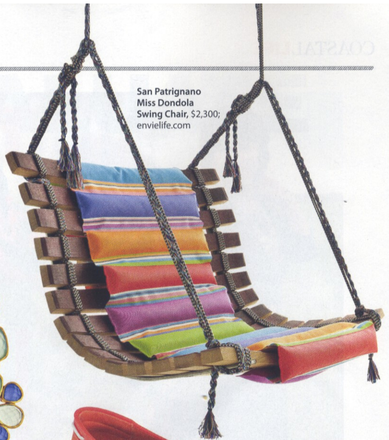
San Patrignano Miss Dondola Swing Chair, $2,300; enviellife.com