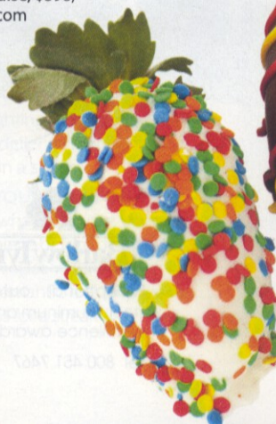
Shari's Berries Hand-Dipped Birthday Strawberries, $30 for ½ dozen; berries.com